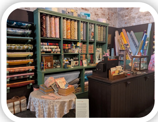
Violet Buckle's Shop